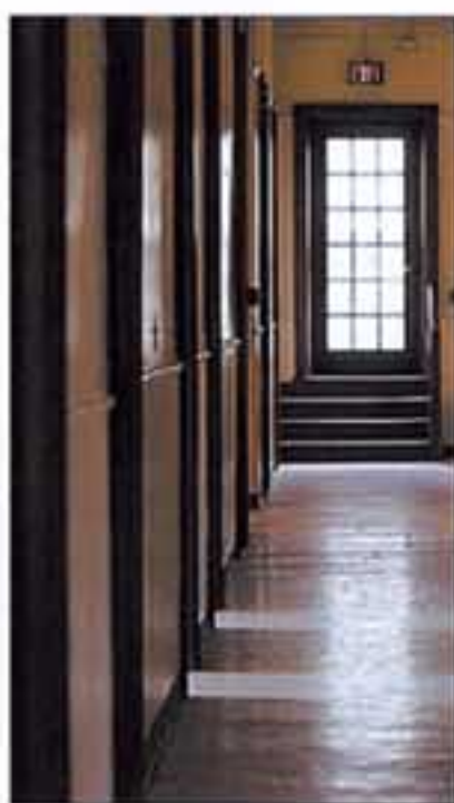
Classroom doors will be saved.