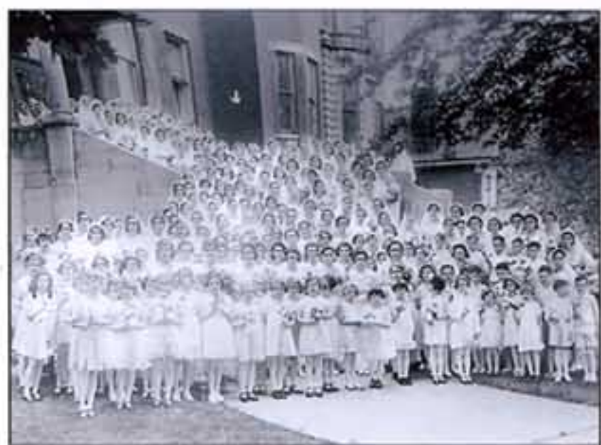
The graduating class of 1932, Loretto Abbey College School.