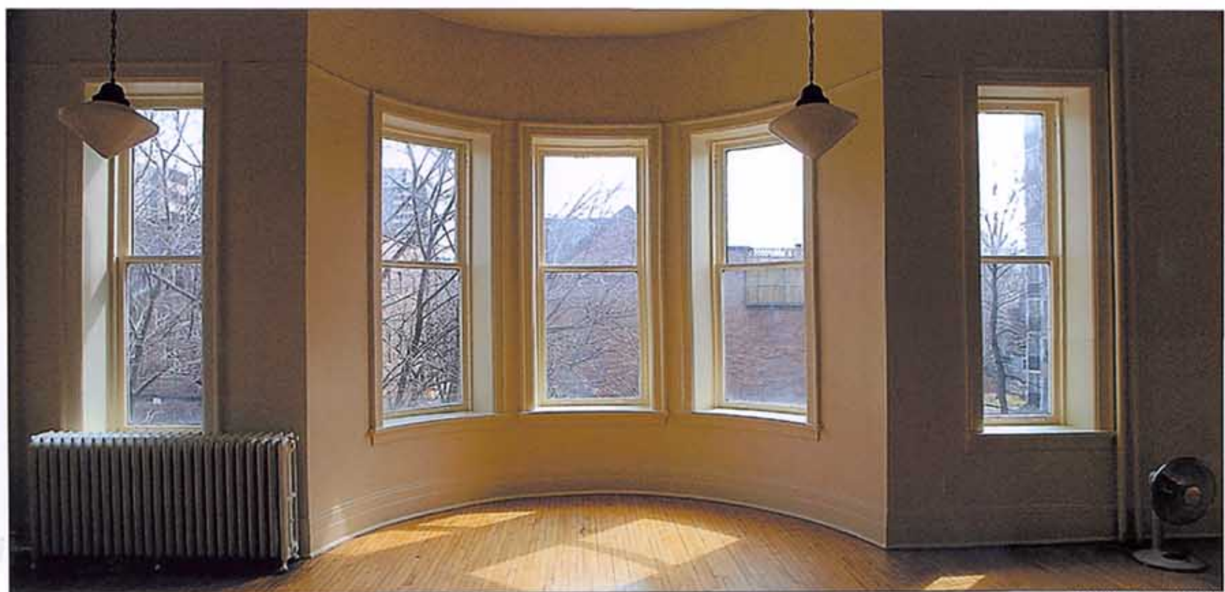
Sunshine streams in from one of the large bay windows on the building's front façade.

The neighbourhood is an eclectic mix of solid, large old homes with spacious verandahs that generally sell for $750,000 to $1-million, nondescript houses that wouldn't be missed if they were torn down, and apartment buildings that have seen