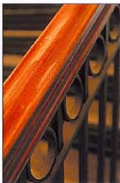
A handrail polished over the decades by students' hands.