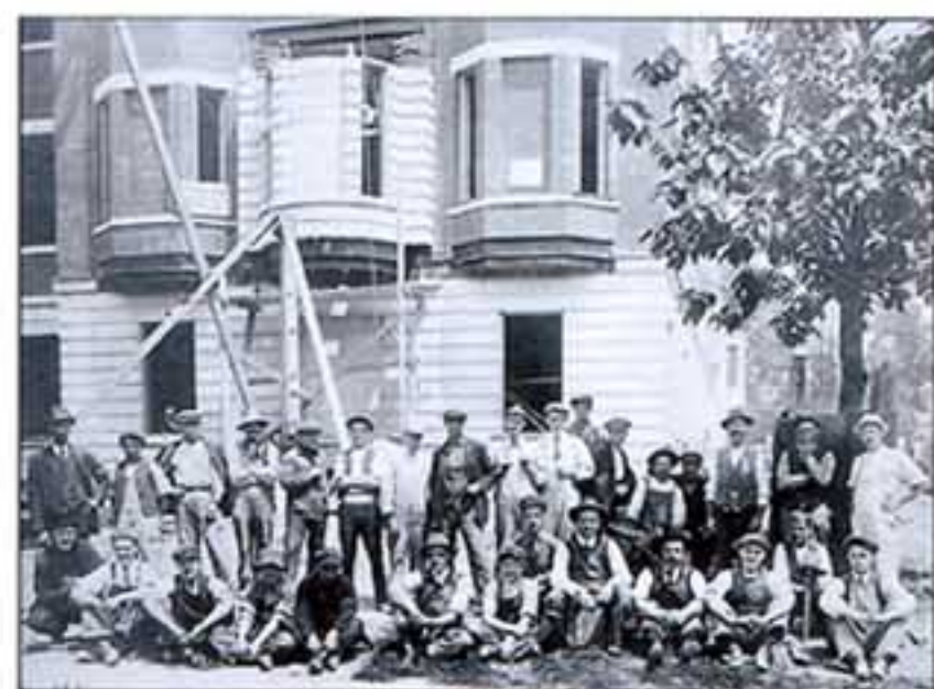
Builders take a break, 1914. Centre, the school circa 1920.