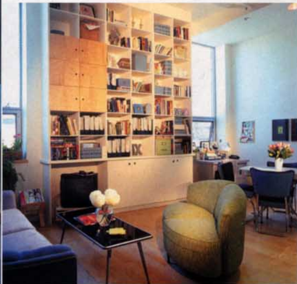
The suites in the South Tower of Radio City feature an innovative approach to living space, with nine-foot ceilings, and lots of windows.