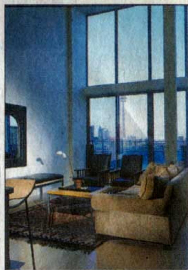
The two-storey penthouse at Radio City— with terrace — will resemble this model.